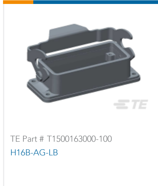
TE Part # T1500163000-100 H16B-AG-LB