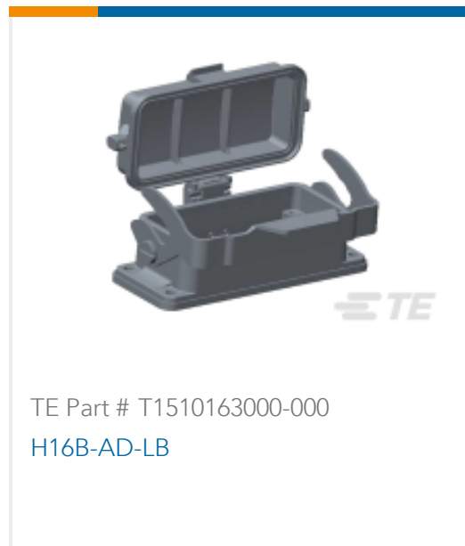
TE Part # T1510163000-000 H16B-AD-LB