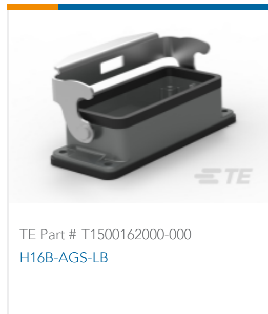
TE Part # T1500162000-000 H16B-AGS-LB