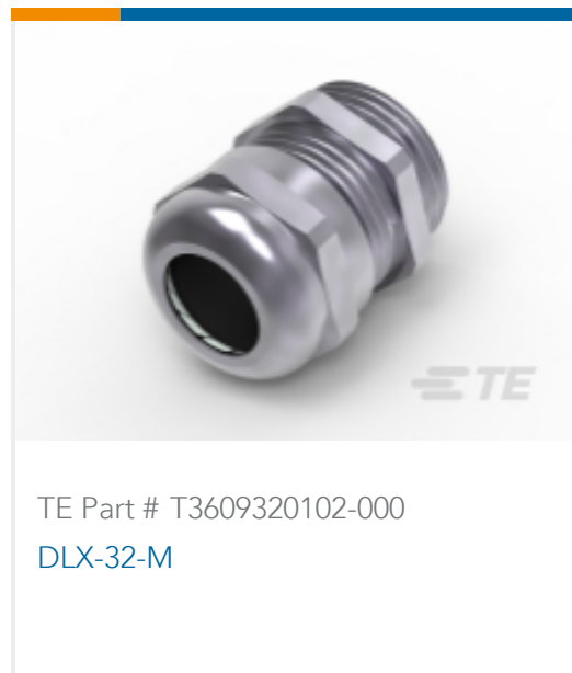
TE Part # T3609320102-000 DLX-32-M