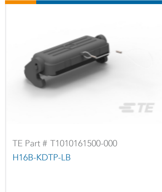
TE Part # T1010161500-000 H16B-KDTP-LB