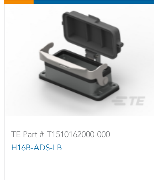
TE Part # T1510162000-000 H16B-ADS-LB