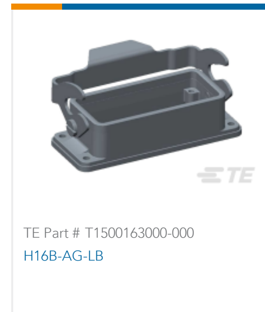
TE Part # T1500163000-000 H16B-AG-LB