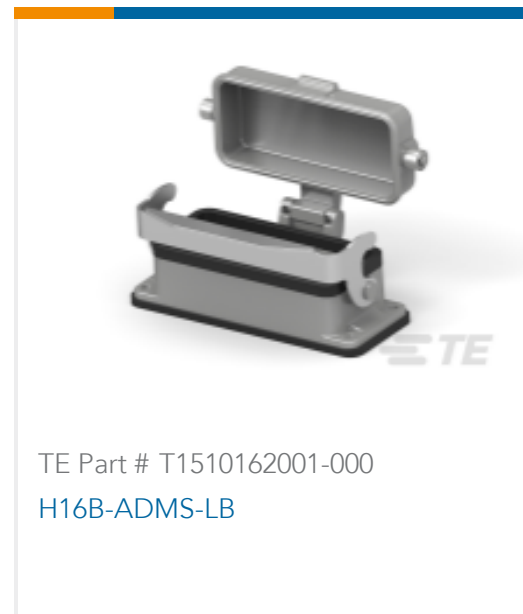
TE Part # T1510162001-000 H16B-ADMS-LB