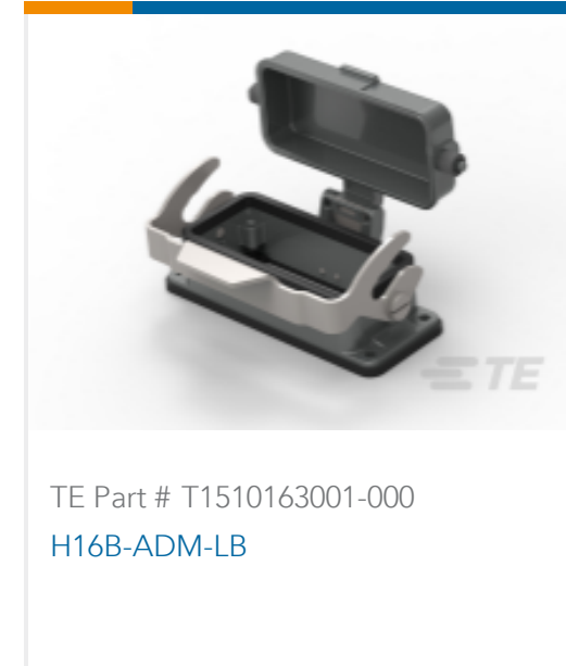
TE Part # T1510163001-000 H16B-ADM-LB