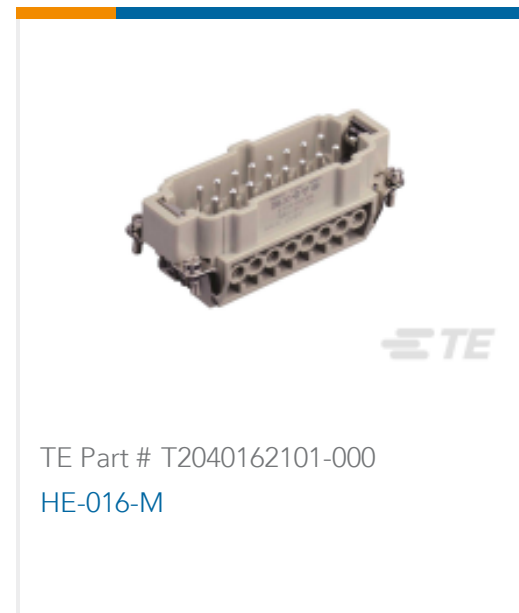
TE Part # T2040162101-000 HE-016-M