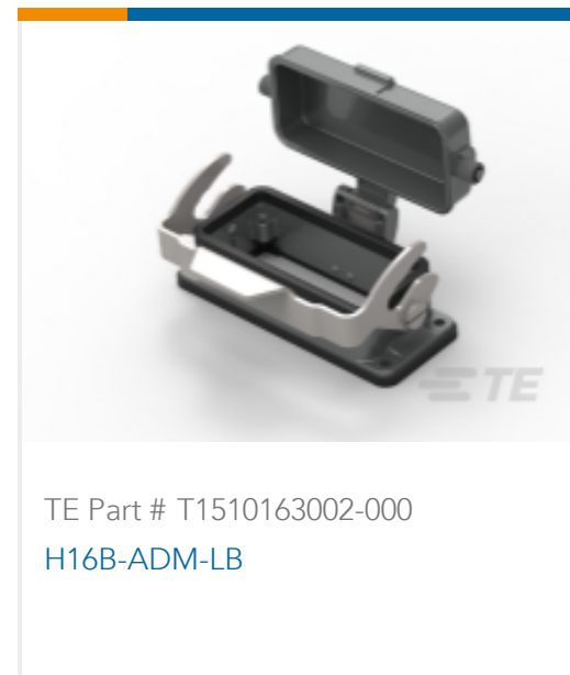
TE Part # T1510163002-000 H16B-ADM-LB